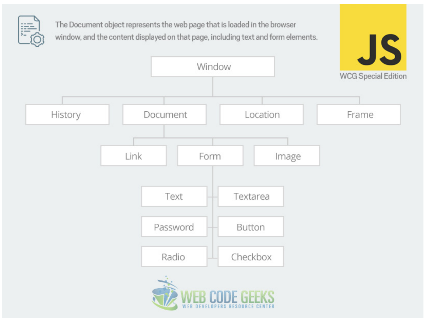
Figure 1.2: The Javascript Object Hierarchy

Properties define the characteristics of an object. Examples: color, length, name, height, width Methods are the actions that the object can perform or that can be performed on the object. Examples: alert, confirm, write, open, close .