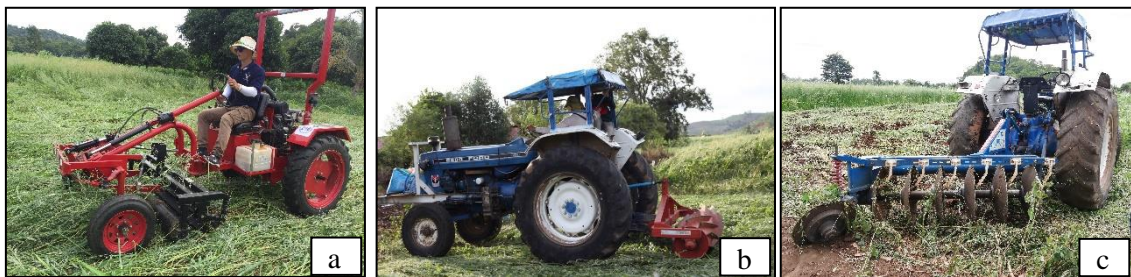
Fig. 1 (a) USDA roller-crimper, mounted on Oggun; (b) Cambodian made roller-crimper, pulled by 75-hp diesel tractor; (c) disc-plow with six discs

The data were analyzed performing analysis of variance (ANOVA) by using the R-software 6.3.1 available online. Fisher's protected LSD test at \alpha = 0.05 probability level was used to show significant difference and to determine interactions between treatment means, periods before and after rolling, and soil depths.