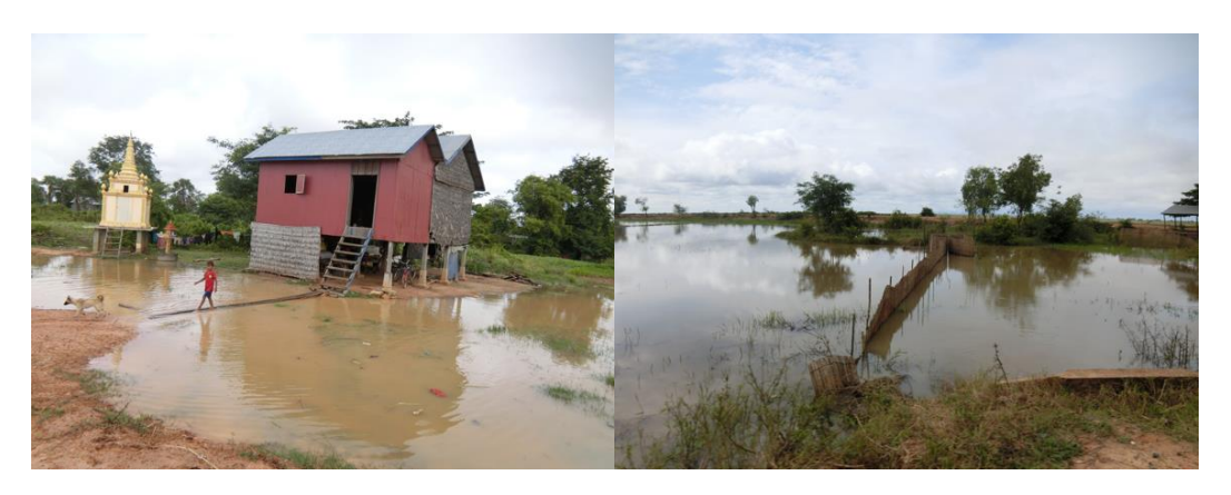
Fig. 2 Shelter in flood-prone areas along paddy field (left) and higher road to evacuate (right)

Villagers have similar flood-induced impacts in the post-flood situation, such as food insecurity, health problem, financial shortage, lack of accessibility, and loss of human lives and livestock. Due to lack of portable water, people reluctantly drink flood water, even though it may cause diarrhea and other health issues. Children generally suffer from diarrhea and accidental drown due to unsafe and high-level water. Many villagers also critically suffer from income shortage without accessibility to the big lake southern part of the village as well as Steung Sen River, where people gain profit from morning glory and fish sales.