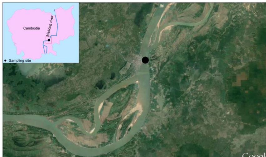
Fig. 1 Map showing the sampling location

This study was conducted in the Lower Mekong Basin of Cambodia which located in the Kampong Cham Province (Fig. 1).